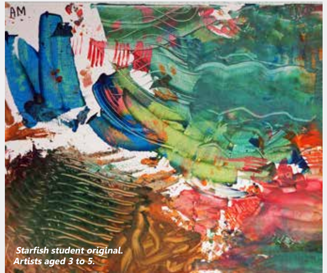
Starfish student original. Artists aged 3 to 5.

Our kids would love to have you visit a classroom. Book your "play date" now by emailing devpt@sfish.org or call (734) 728-3400.